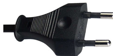
Type C (CEE 7/16 Europlug)