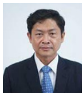
Sok Silo Secretary General of the Council for Agricultural and Rural Development (Cambodia)