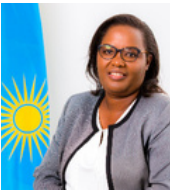
Gérardine Mukeshimana Minister of Agriculture (Rwanda)