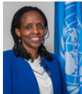
Agnes Kalibata President, Alliance for a Green Revolution in Africa (AGRA), Former United Nations Special Envoy on the Food Systems Summit