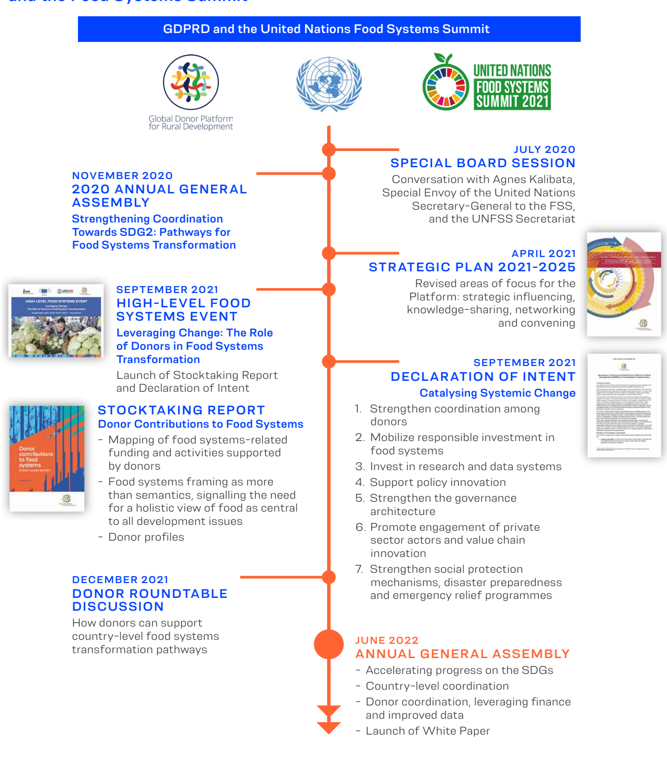
FIGURE 1 The activities of the GDPRD engaging with the food systems framework and the Food Systems Summit

The Summit process mobilized widespread engagement from across governments, civil society, farmers' organizations, business and science, all of which was underpinned by the national and cross-cutting Summit dialogue processes. The need for profound changes in food systems – the why of food systems transformation – has been unambiguously laid out with backing from