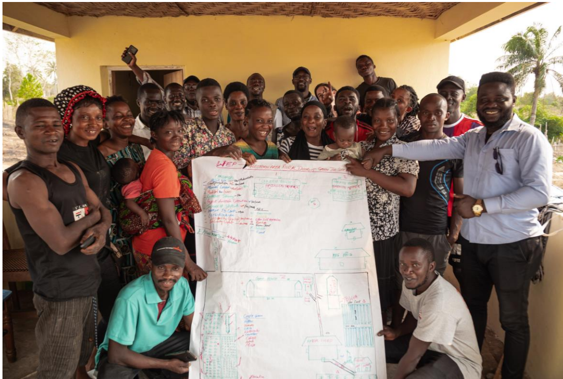
Photo: Green Jobs youth participants working in Wage Employment Programme in Sierra Leone