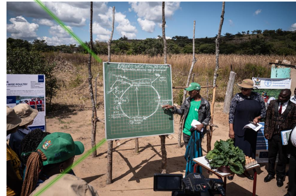
Green Component of Courage Gwena's Egg Production Business developed by Courage